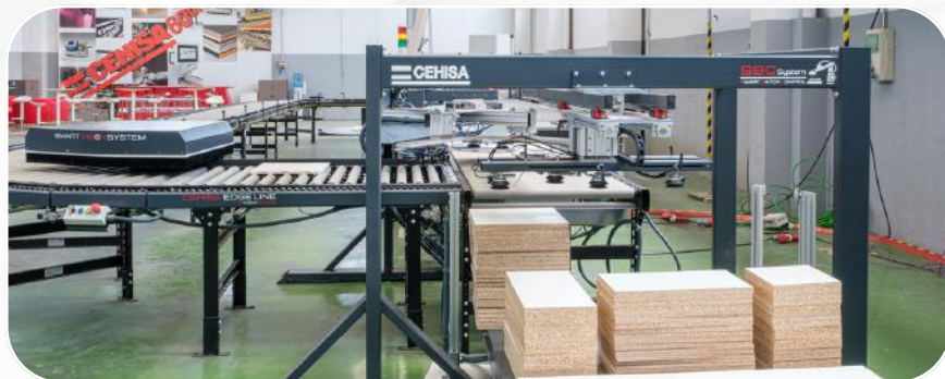
AUTOMATIC LOADING AND UNLOADING

CEHISA EDGE LINE edge banding cell offers a 100% automated edging process.