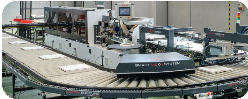
SMART VISION SYSTEM